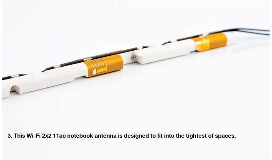
3. This Wi-Fi 2x2 11ac notebook antenna is designed to fit into the tightest of spaces.

Antenna Company’s work is not just here on Earth. Together with Space Engineering and Airbus, the company was awarded a two-year contract by the European Space Agency (ESA) to develop advanced antenna array