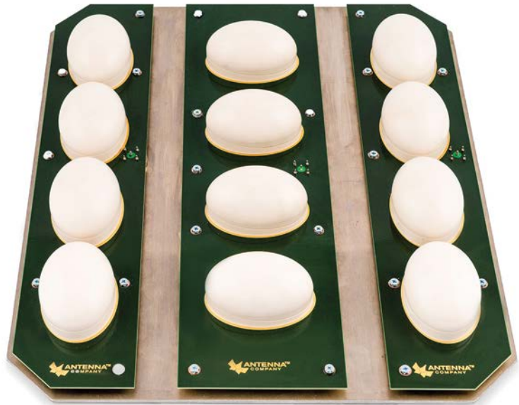
2. SuperShape technology was instrumental in creating the unique shape of this Wi-Fi directional outdoor router antenna.

Some wireless connectivity problems stem from antennas with low gain and efficiency that fail to provide the required system signal strength due to propagation losses and reflections from walls and other barriers. Unwanted coupling between multiple antennas in a mobile device can also lead to