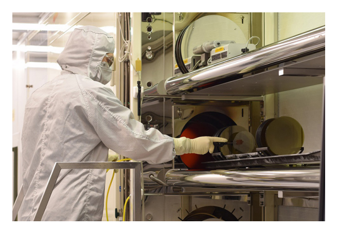
1. GaN semiconductor devices for optical and RF/microwave applications are available from a wide range of suppliers, in many forms, from wafer level to packaged devices.

GaN is available to the RF/microwave industry in a wide range of products, from die-level wafers ( Figure. 1 ) to rugged high-power packaged microwave amplifiers and transistors ( Figure. 2 ). Increased interest in GaN as a starting point for optical diodes, including anti-bacterial ultraviolet (UV) lights in healthcare applications, expands potential applications for GaN transistors and semiconductor devices in automotive, consumer electronics, defense and aerospace, healthcare, and industrial power systems. GaN transistors serve as the active