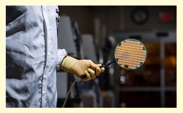
GaN and GaAs 6"-in. diameter semiconductor wafers are part of a foundry that serves both military and commercial customers.

BAE Systems (Nashua, N.H.), another DoD-accredited partner, also provides GaN and GaAs foundries for industry use, backed by 6"-in.wafer production runs. The foundry provides GaN-HEMTbased foundry services (see figure) to the U.S. Department of Defense (DoD) and the design community at large for monolithic microwave integrated circuits (MMICs) from 1 to over 200 GHz. For those who prefer a variation, the foundry services from Wolfspeed are based on 100-mm-diameter, GaN-on-SiC IC technology backed by design and testing capabilities.