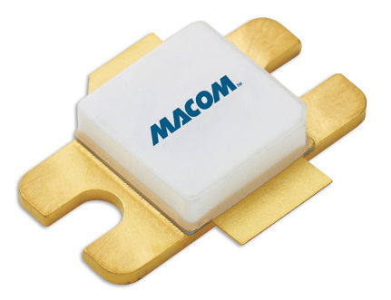
2. To make mmWave frequency semiconductors more affordable to consumers, GaN devices must be supplied in a variety of low-cost packages, including plastic packages. (Courtesy of MACOM)

Among the problems in generating large power (and the associated heat due to losses) from a small package is the thermal dissipation and need to minimize the effects of heat on circuit performance. In addition to the transistor, the rising temperatures can also impact the performance of the circuit and its surrounding components mounted on the circuits. For that reason, many GaN devices are mounted on silicon (Si), siliconcarbide (SiC), or even silicongermanium (SiGe) substrates to help draw heat away from the active device tesy of MACOM) regions.